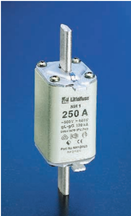
All NH fuse links incorporate a blown fuse indicator.

Littelfuse European style NH fuse links are designed for the protection of conductors and motors. The gL-gG characteristic fuse links are generally used to protect cables and installation lines from overload and short circuits. The aM characteristic fuse links are used for the short circuit protection of motors and switchgear. They are available in NH00C to NH3 sizes up to 630 amperes.